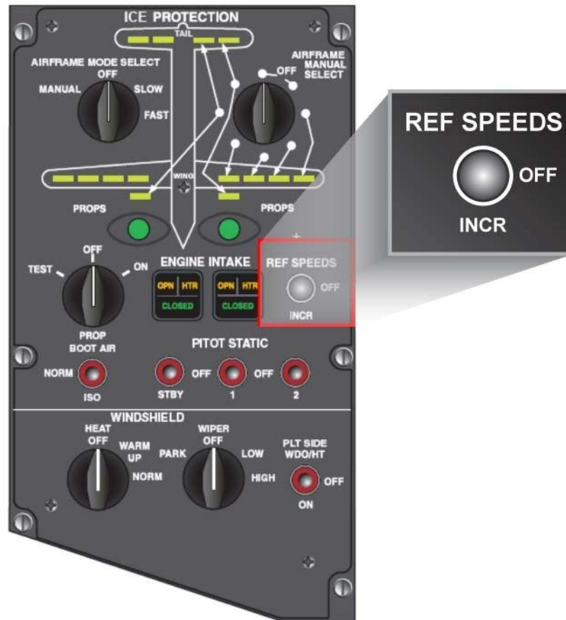
Figure 2. Q400 Reference Speeds Switch