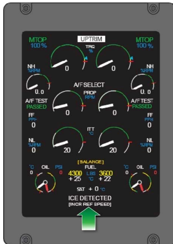
Figure 3. Q400 Engine Display Showing Ice Detected and Increased Reference Speeds Message

The Q400 engine display shows an “ICE DETECTED” message, as shown in figure 3, when one or both ice detector probes detect more than 0.5 millimeter (0.02 inch) of ice. The message appears in reverse video (black letters on a white background) for 5 seconds if the ref speeds switch has already been set to the increase position. After the 5-second period, the message appears in normal video (white letters on a black background, as shown in figure 3) when ice is detected and the ref speeds switch remains set to the increase position. If the ref speeds switch is set to the off position when ice is detected, the message flashes with yellow letters on a black background until the switch is turned to the increase position. In addition, when the switch has been selected to the increase position, an “INCR REF SPEED” message (also shown in figure 3) appears in normal video, regardless of whether ice has been detected.